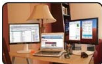
Home Business User